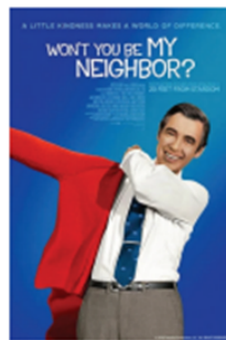
"Won't You Be My Neighbor" documentary @ 6 PM

Good Neighbor Kindness Challenge for kids and teens. From March 20th - April 23rd, complete kindness activities to unlock rewards. To sign up, scan the QR code or visit https://nafclibrary.beanstack.org/