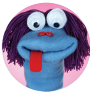
Puppet Making Workshop for kids & teens @ 3 PM

Enjoy a celebration of all things Mister Rogers with fun activities, crafts, book giveaways, and more!