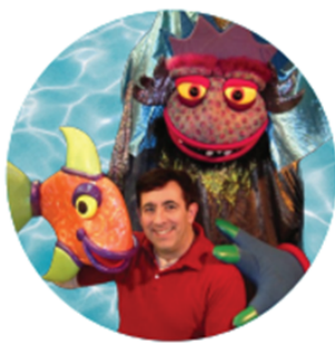
Madcap Puppets Show "When You Wish Upon A Fish" @ 4:30 PM