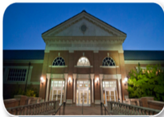
Horner Health & Recreation Center