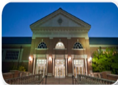
Horner Health & Recreation Center